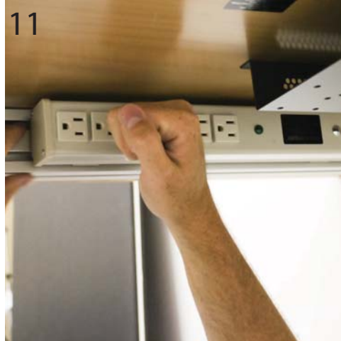
11 With the supplied plastic tabs snapped into place on underside of Surge Protector, align with grooves in support rail and gently push into place (qty 1).