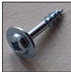
WASHER HEAD SCREW 1/4"-20 x 1"