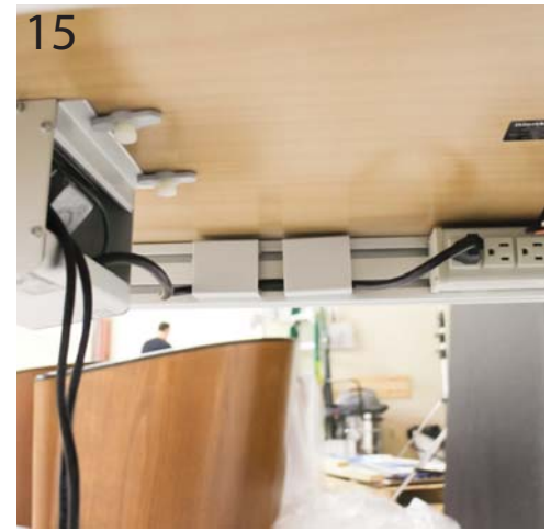
15 Manage all cabling using the Wire Clips.