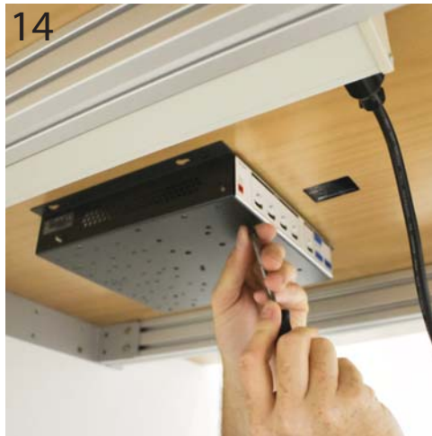
14 Secure Switcher Box with screws provided by the Manufacturer.