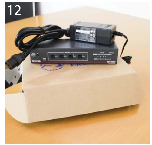
12 If your installation includes a Switcher Box - locate it now.