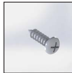
WOOD SCREW 1/4"-20 x 5/8"