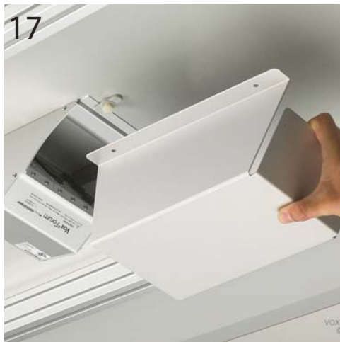
17 Manage all "Show Me" cables with Wire Management trays. To install, position closely to Forum and screw in place with #6 x 5/8" wood screws (qty4).