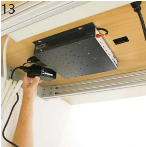
13 Slide the Switcher Box into place in Shelf.