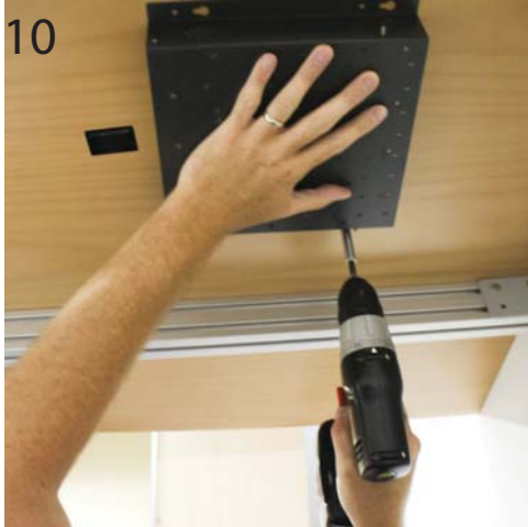
10 Mount the Switcher Box shelf in place using #6 x 5/8" screws (qty 4).

THIS DRAWING IS CONFIDENTIAL AND PROPRIETARY. NO PART OF THIS DRAWING MAY BE COPIED, DISCLOSED TO ANY THIRD PARTY OR USED FOR ANY PURPOSE WITHOUT THE EXPRESS WRITTEN AUTHORIZATION OF NIENKÄMPER FURNITURE & ACCESSORIES