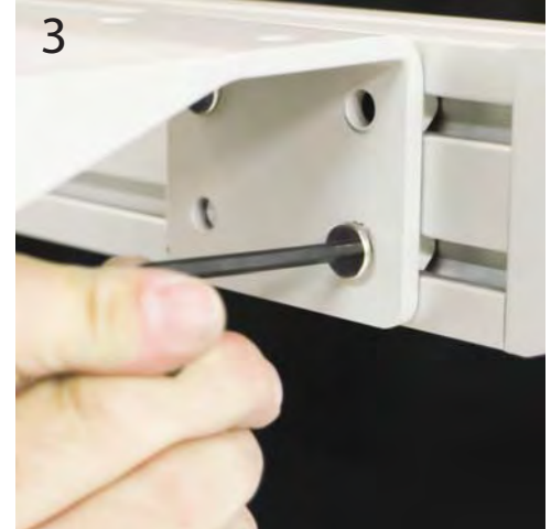
3 Repeat steps 2 and 3 for second rail.