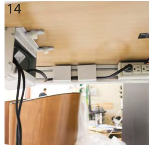
14 Manage all cabling using the Wire Clips.