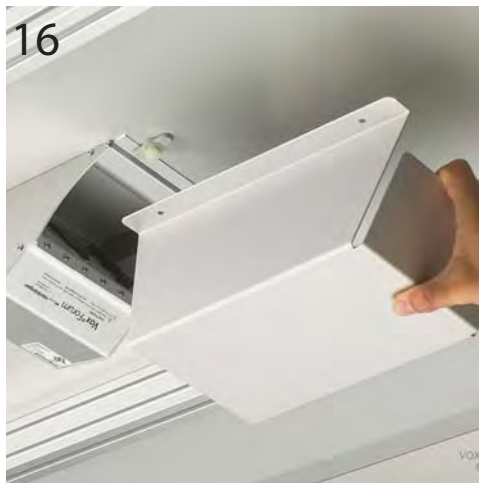
16 Manage all "Show Me" cables with Wire Management trays. To install, position closely to Forum and screw in place with #6 x 5/8" wood screws (qty4).