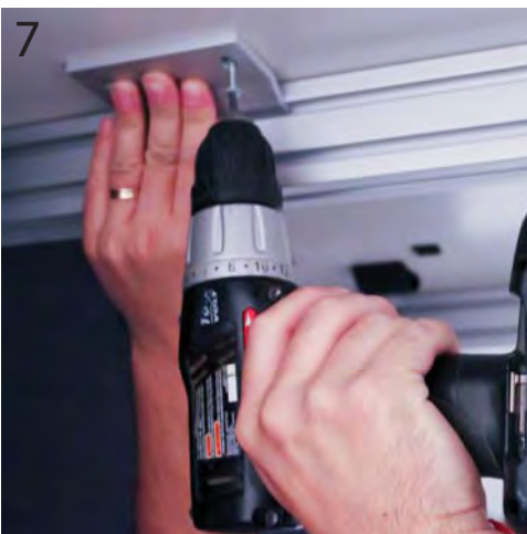
7 Fix the Rail to the top with #8 x 1" Washer Head Wood Screws (qty 4) and Mounting plate (qty 2).