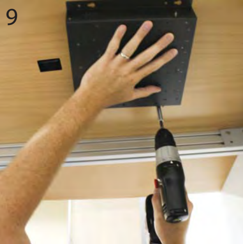
9 Mount the Switcher Box shelf in place using #6 x 5/8" screws (qty 4).

THIS DRAWING IS CONFIDENTIAL AND PROPRIETARY. NO PART OF THIS DRAWING MAY BE COPIED, DISCLOSED TO ANY THIRD PARTY OR USED FOR ANY PURPOSE WITHOUT THE EXPRESS WRITTEN AUTHORIZATION OF NIENKÄMPER FURNITURE & ACCESSORIES