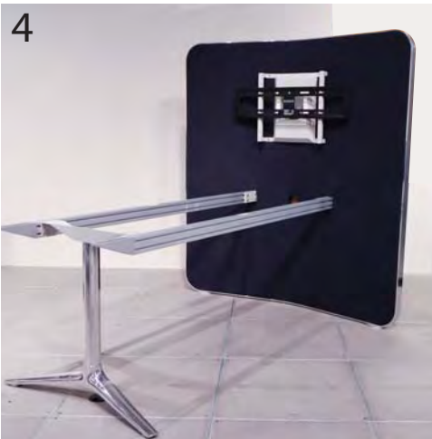
4 Completed Support Rail and Base structure.