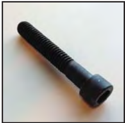
SOCKET HEAD CAP SCREW 5/16"-18 X 1 1/2"