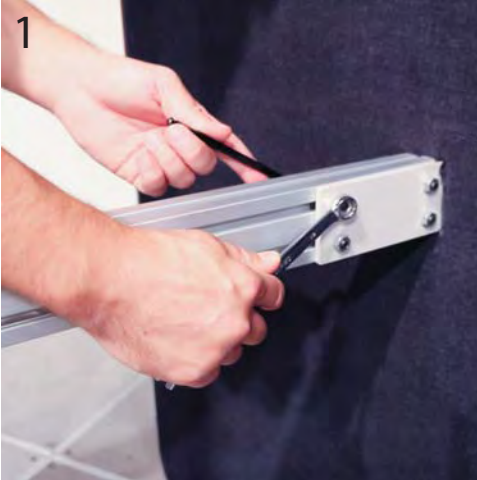
1 Fasten Support Rail the brackets pre-installed in media wall with 5/16"-18 x 1 1/2" socket head cap screw, lock washer and hex nut (qty 4 per bracket)

THIS DRAWING IS CONFIDENTIAL AND PROPRIETARY. NO PART OF THIS DRAWING MAY BE COPIED, DISCLOSED TO ANY THIRD PARTY OR USED FOR ANY PURPOSE WITHOUT THE EXPRESS WRITTEN AUTHORIZATION OF NIENKÄMPER FURNITURE & ACCESSORIES