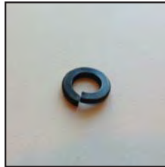
LOCK WASHER 5/16"