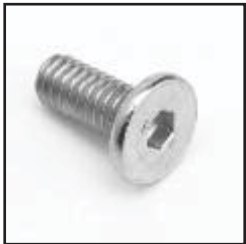
JOINER BOLT 1/4"-20 x 9/16"