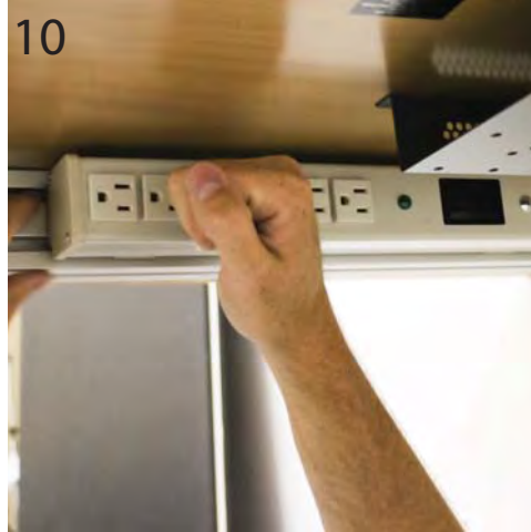
10 With the supplied plastic tabs snapped into place on underside of Surge Protector, align with grooves in support rail and gently push into place (qty 1).