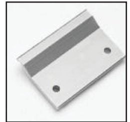
MOUNTING PLATE 1/4" x 3" x 4"