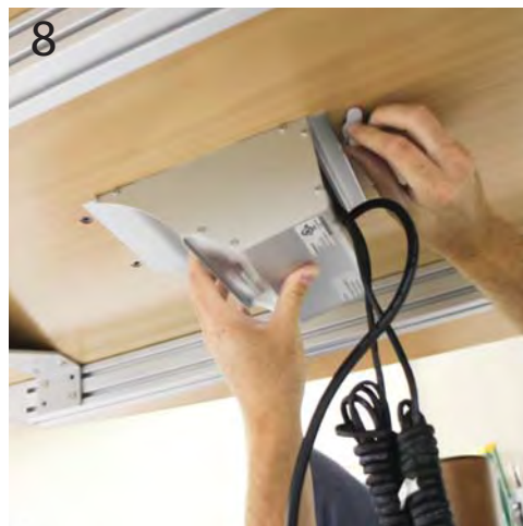
8 Vox Forums mount from underside and are held in place with plastic thumb screws and tabs (qty 4).