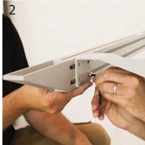
2 Fasten Support Rail to Base with 1/4"-20 x 9/16" joiner bolts (qty 4)