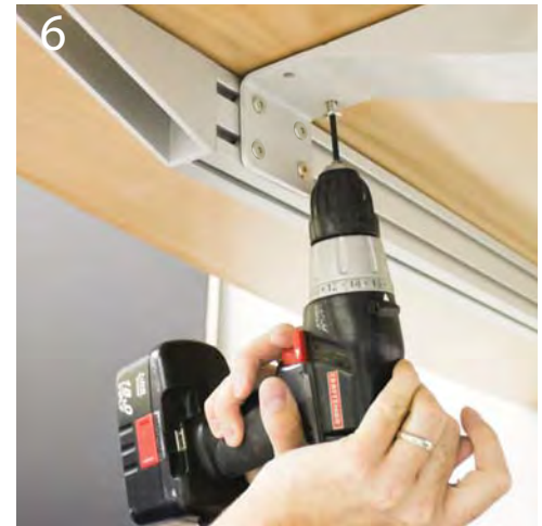
6 Fix the Base to the top with 1/4"-20 x 1" Joiner Bolts (qty 4)