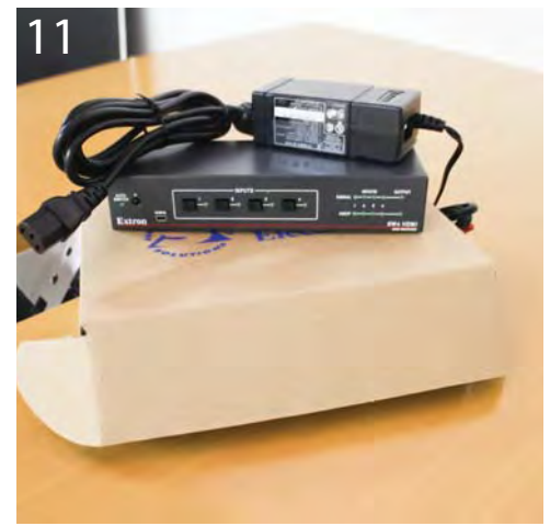
11 If your installation includes a Switcher Box - locate it now.