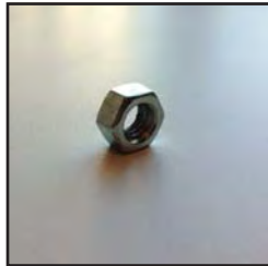
HEX NUT 5/16"-18