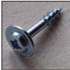
WASHER HEAD SCREW 1/4"-20 x 1"