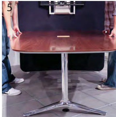
5 Carefully set the Top in place on the Rail Structure.