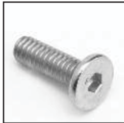
JOINER BOLT 1/4"-20 x 1"