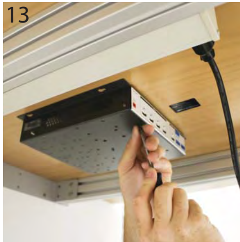
13 Secure Switcher Box with screws provided by the Manufacturer.