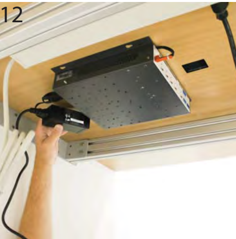
12 Slide the Switcher Box into place in Shelf.