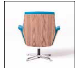
Q Lounge chair upholstered in Unika Vaev fabric, Feel 679/35 Lucky