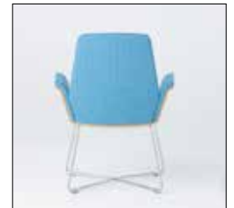
Q Side chair upholstered in Unika Vaev fabric Muse 62114/140 Dancer with natural walnut veneer shell