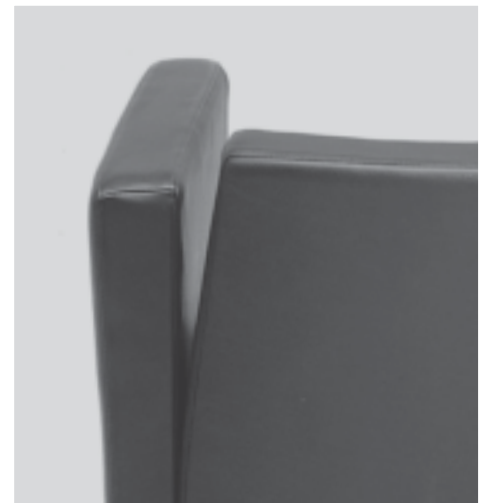
23201 Satori sh 17 1 / 2 " ah 28 1 / 2 " w 26 1 / 2 " d 25" h 30"