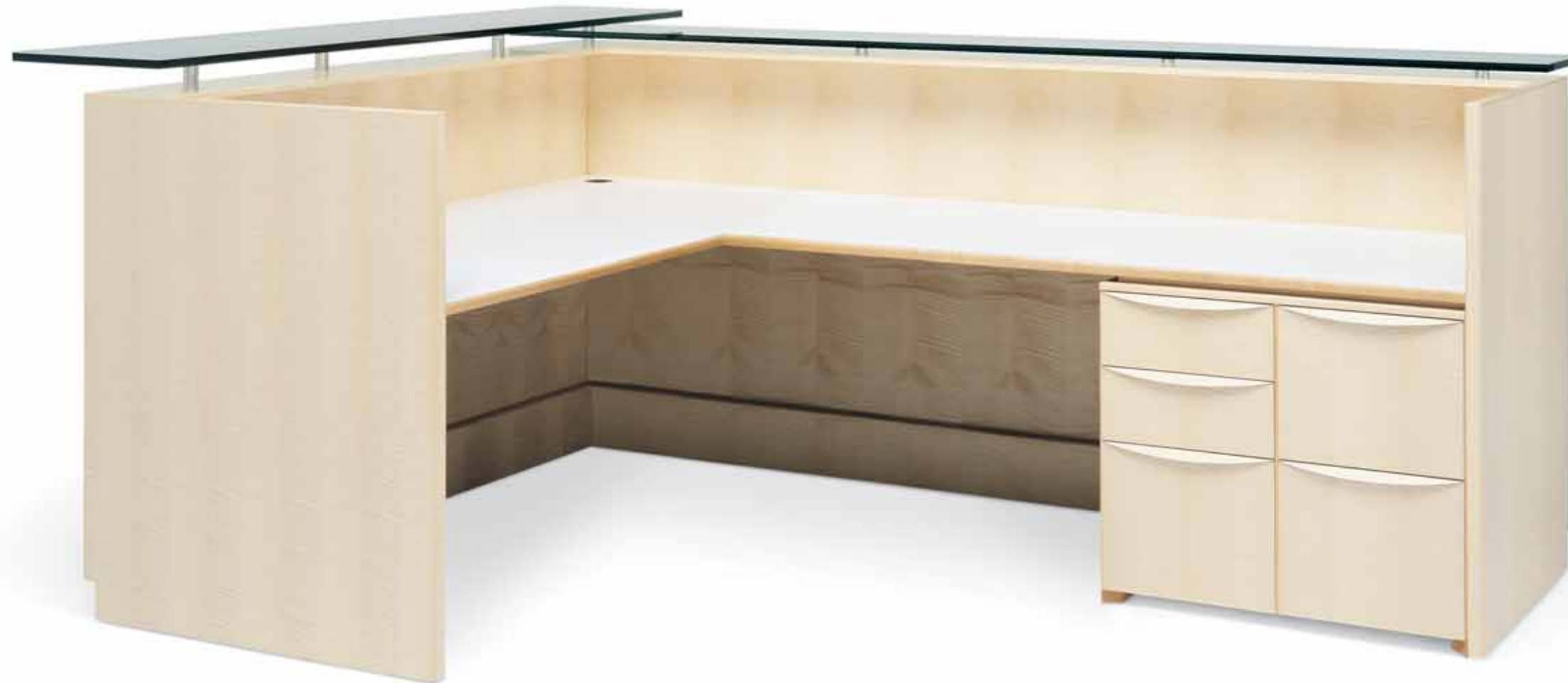
Straight-front reception desk in quarter-cut, book-matched natural figured sycamore veneer with gallery surround glass transaction top

reception desks from Nienkämper subtly convey professionalism and stability. At Nienkämper, we believe in design that makes a great first impression. And we believe in design that lasts.