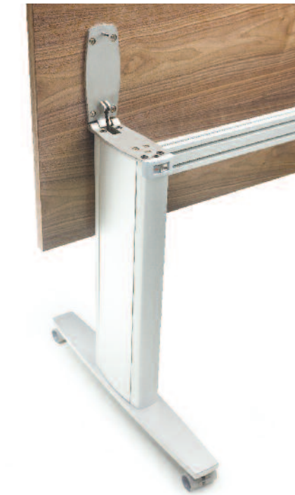
Wood grain plastic laminate tops with translucent edge: