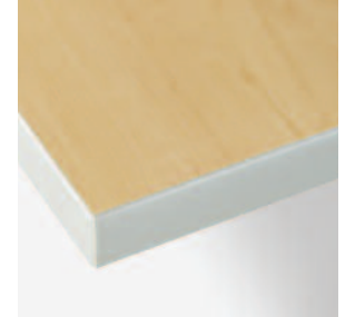
WL1 – Champagne Sagewood