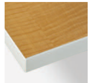
WL4 - Anagre