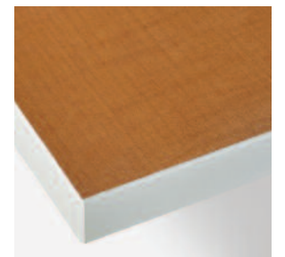
WL9 – Huntington Maple