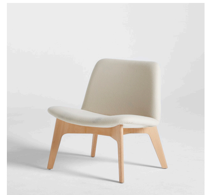
Nordic design: Nienkamper

Very economically priced chair. Black mesh back and upholstered seat. The chair is available with and without a headrest.