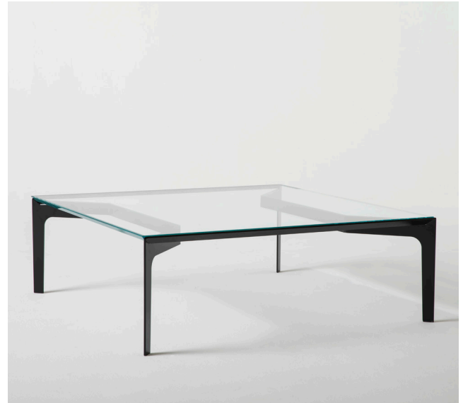
YP Coffee Table design: Yabu Pushelburg

Vox® FlipTop™ height-adjustable tables enable you to choose the most comfortable way to work. You can vary your position from sitting to standing allowing for a variety of postures throughout the day. The electric mechanism allows you to quickly and quietly adjust the height of the table from 28" to 40" while the two base columns stay perfectly in sync as they move up and down.