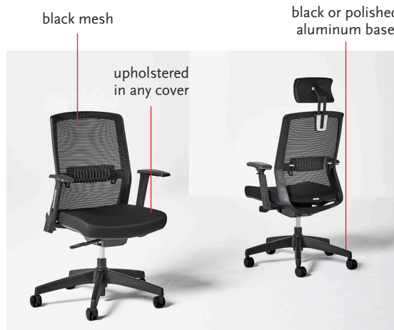
Senator Mesh Back design: Nienkamper