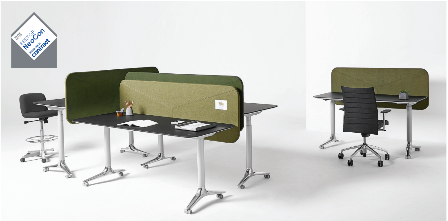
Gateway™ Height Adjustable Table design: busk + hertzog