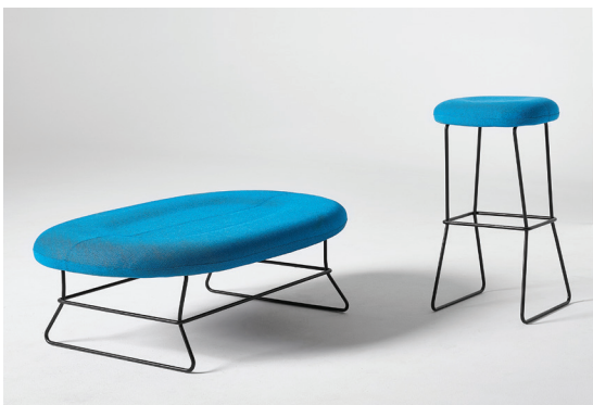
Caravite Bench and Stool design: busk + hertzog

The Vox® Solid wood table was manufactured from a fallen California Redwood tree. When the slabs were cut to make the table; a small animal had made a nest in the center of the tree making the center portion unusable. We decided to remove the center portion which left the perfect channel for connectivity devises. The slab legs were hollowed allowing wires to travel to the floor without being seen. Levellers on the bottom of the legs allow table height adjustment and room for the wires to reach power sources. The solid wood top is supported by a very sophisticated engineered slim steel rail system embedded in the underside of the top. The rails prevent warping which is natural to a solid top over time.