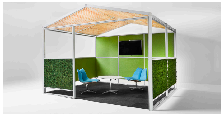
Gazebo Meeting Pod design: Nienkamper

Designed by Nienkämper, Gazebo Meeting Pod creates a finely crafted indoor oasis with an emphasis on comfort and productivity, suitable for a variety of applications within office environments. The innovative structure provides a relaxed and technology-enabled setting for casual or more formal meetings, and improves indoor air quality with the incorporation of biophilic elements.