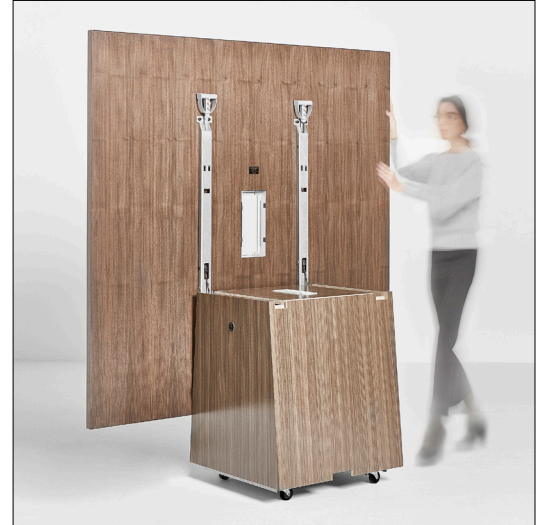
Vox® Mega Flip Table design: Nienkamper

The Vox® Mega Flip table is easy to move and reconfigure. The tables are ganged together to create an almost seamless conference table. To reconfigure the tables unlatch the table ganging brackets. The ganging brackets are always attached to the table and do not require tools to remove. To fold the table, pull the handles on the underside of the table top towards you; releases two latches that secure the top in place. The table comes equipped with a simple forum with your choice of power and av options. The front panel on the bases easily removes to unplug the table from the floor monument. When in use the base sits flush. The base has 4 swivel casters which are lowered and raised by the push of a button on the side of the base. The 60" x 60" Vox® Mega Flip table has a width of only 27" when folded and will fit through door ways. Available in sizes are 60"d x 60"w x 29"h, 54"d x 54"w x 29"h and all standard woods and plastic laminates.