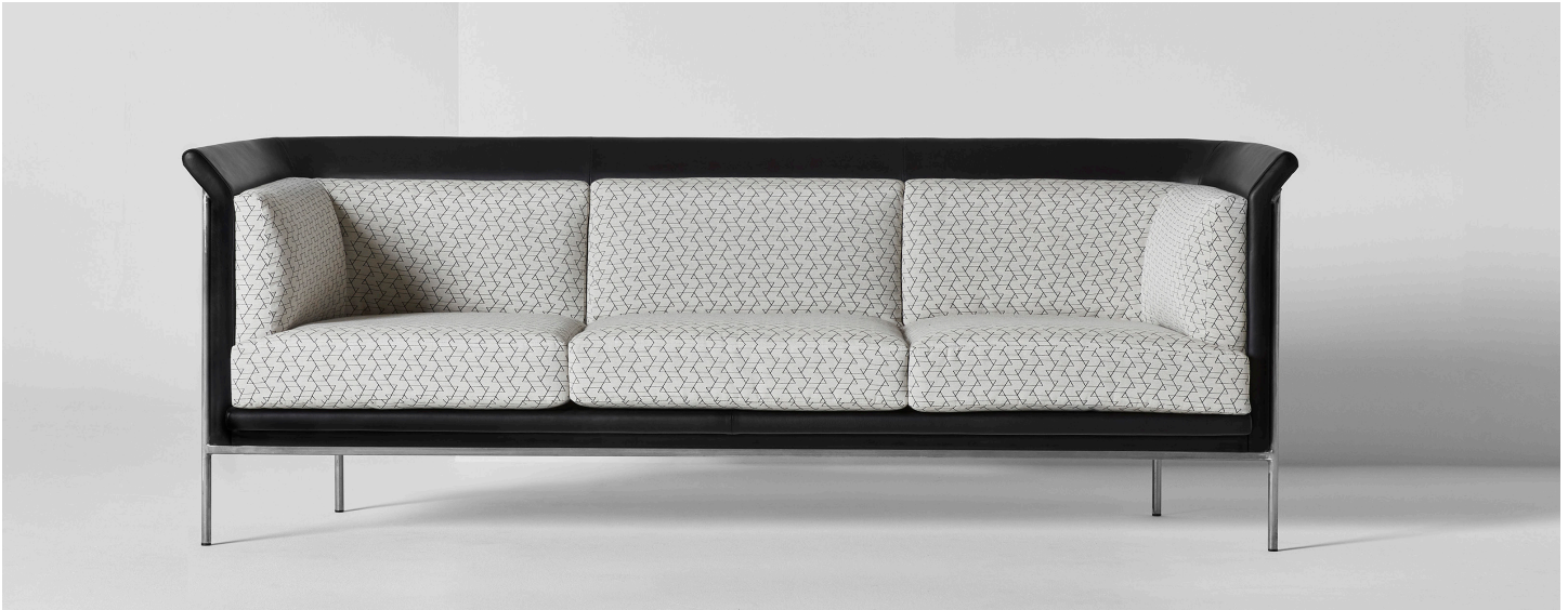
J + J Studio Sofa design: MSDS Studio

J & J Studio Sofa's curved steel frame shapes beautifully in a drawing, but the manufacturing process to create the shape would be a challenge to any metal fabricator. However, employing the cutting edge manufacturing techniques Nienkämper has fabulously created the shape.