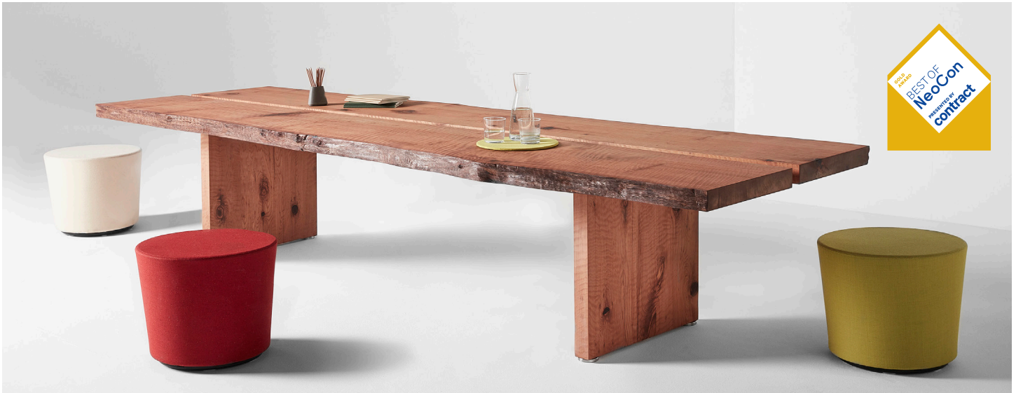
Vox® Solid Wood Top Table design: Nienkamper

The Vox® Solid wood table was manufactured from a fallen California Redwood tree. When the slabs were cut to make the table; a small animal had made a nest in the center of the tree making the center portion unusable. We decided to remove the center portion which left the perfect channel for connectivity devises. The slab legs were hollowed allowing wires to travel to the floor without being seen. Levellers on the bottom of the legs allow table height adjustment and room for the wires to reach power sources. The solid wood top is supported by a very sophisticated engineered slim steel rail system embedded in the underside of the top. The rails prevent warping which is natural to a solid top over time.