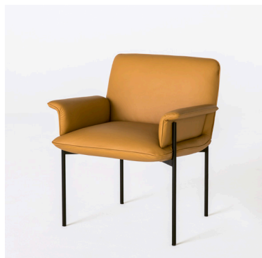
Kush design: MSDS Studio

Caravite Bench and Stool suitable for many applications. The distinctive contoured seat on both stool and bench adds comfort. Pleasing top stitch detail can blend or add contrast to the seat upholstery. Light and modern for any environment.