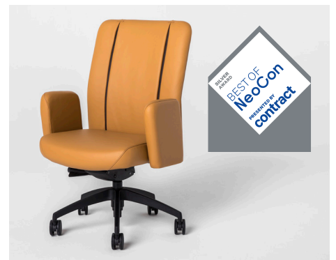
Trench design: Favaretto & Partners

Kush welcomes you with an abundance of character and comfort while maintaining an elegant and shapely silhouette. The soft volumes reach out to embrace the slim metal base, creating an interesting intersection between the base and its cushions.