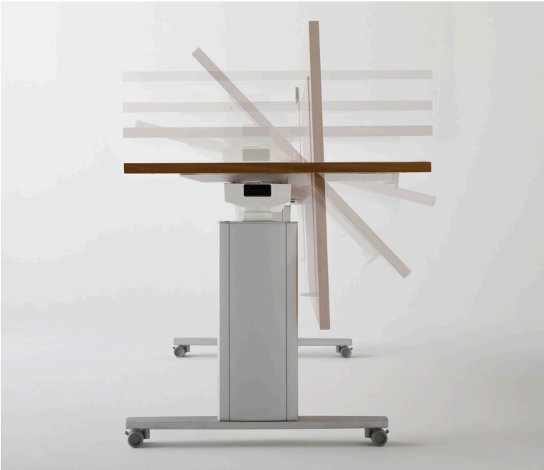
Vox FlipTop™ Height Adjustable Table design: Nienkamper

Vox® FlipTop™ height-adjustable tables enable you to choose the most comfortable way to work. You can vary your position from sitting to standing allowing for a variety of postures throughout the day. The electric mechanism allows you to quickly and quietly adjust the height of the table from 28" to 40" while the two base columns stay perfectly in sync as they move up and down.