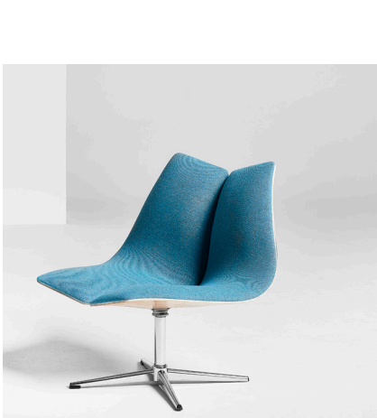
Sorensen design: Chris Sorensen

The Vox® Mega Flip table is easy to move and reconfigure. The tables are ganged together to create an almost seamless conference table. To reconfigure the tables unlatch the table ganging brackets. The ganging brackets are always attached to the table and do not require tools to remove. To fold the table, pull the handles on the underside of the table top towards you; releases two latches that secure the top in place. The table comes equipped with a simple forum with your choice of power and av options. The front panel on the bases easily removes to unplug the table from the floor monument. When in use the base sits flush. The base has 4 swivel casters which are lowered and raised by the push of a button on the side of the base. The 60" x 60" Vox® Mega Flip table has a width of only 27" when folded and will fit through door ways. Available in sizes are 60"d x 60"w x 29"h, 54"d x 54"w x 29"h and all standard woods and plastic laminates.