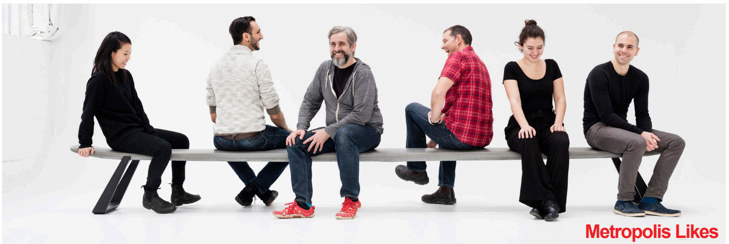
Perplex Bench design: Fig4o

Minimalism and elegance characterize the YP Coffee Table. A crisp architectural black-powder coated steel base supports a ¾" glass top with a beveled edge that rests within the table's beveled frame. This sculptural single-form frame pushes the boundaries of furniture design. The table has a bold aesthetic with slender proportions and a visual lightness, allowing for modern design in both large and small spaces.